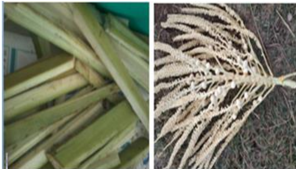
Figure 1 Coco's Petiole and Peduncle

The petiole is the pipeline through which the products of photosynthesis are moved from individual leaves to the rest of a plant and through which necessary chemicals and nutrients from other parts of the plant (e.g., nutrients absorbed through the roots) are brought to individual leaves.