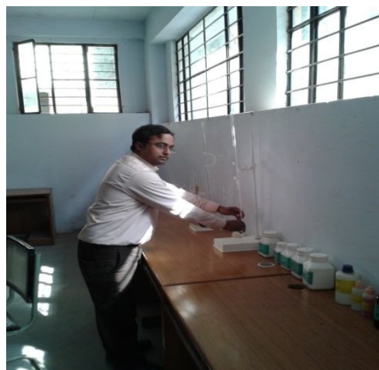
Fig4. Titration process for hardness