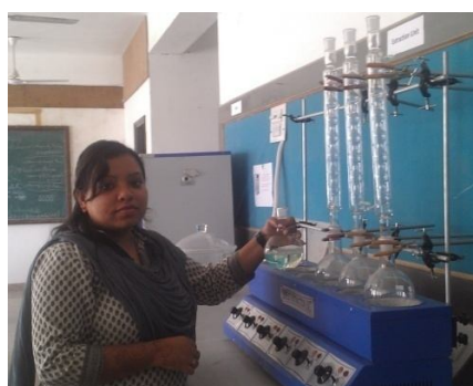
Fig5. Open flux method of COD

COD determines the amount of oxygen required for chemical oxidation of organic matter using a strong chemical oxidant, such as potassium dichromate under reflux conditions.