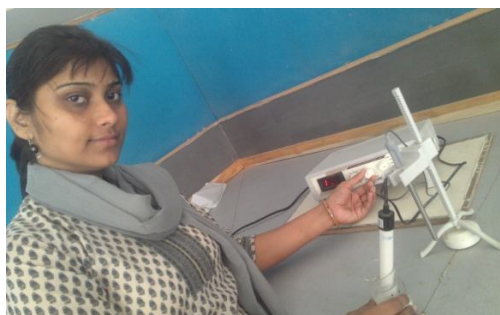
Fig3. Conductivity Test Total Solids

The electrical conductance is reciprocal to the electrical resistance and the G values show total ions per centimetre. It is a numerical expression of the ability of a water sample to carry an electric current. There was not much variation in the Site 1 samples between 1 st and 3 rd week but there was significance variation was noted in site 4 sample which was found to be 2846 µS in 1 st week and 3846 µS.