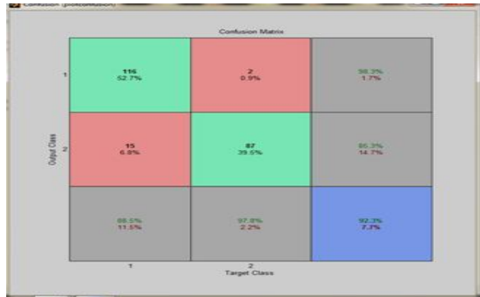
Figure. 2 Plot Confusion Matrix

As the comparison of each trial the maximum value can be obtained by training as 70%, validation 15%, and testing 15%.