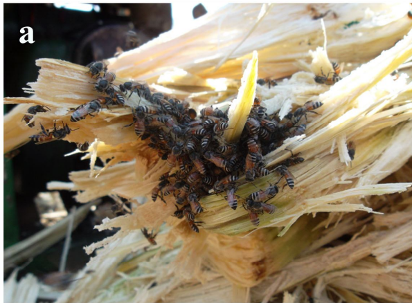
Plate 1 a and b Foraging shift bees in cane juice disposed bagasses center and in flower markets c and d Bees mortality in coffee/tea bars using paper and plastic disposable cups e and f Human responses to rid/kill honey bees by fire and pouring hot water.