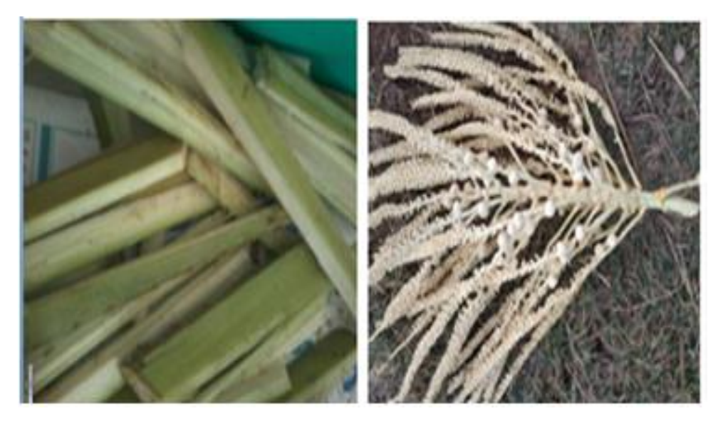
Figure 1 Coco's Petiole and Peduncle

The petiole is the pipeline through which the products of photosynthesis are moved from individual leaves to the rest of a plant and through which necessary chemicals and nutrients from other parts of the plant (e.g., nutrients absorbed through the roots) are brought to individual leaves.