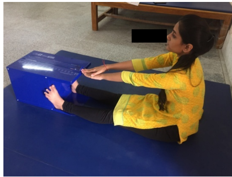
Picture 1: Starting position of Canadian Trunk Forward Flexion Test.