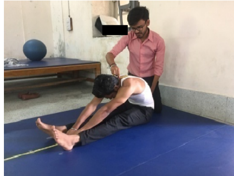
Picture 5: Measurement of the spinal movement, which was measured for both the tests.