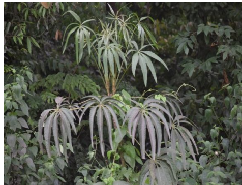
Fig. 4. Oreopanax xalapensis from Sekmai.

Traditional medicines are a principal form of health care for many populations, particularly in low- and middle-income countries, and they have gained attention as an important means of health care coverage globally. In the context of kidney diseases, the challenges and opportunities presented by traditional medicine practices are among the most important considerations for developing effective and sustainable public health strategies. However, little is known about the practices of traditional medicines in relation to kidney diseases, especially concerning benefits and harms. Kidney diseases may be caused, treated, prevented, improved, or worsened by traditional medicines