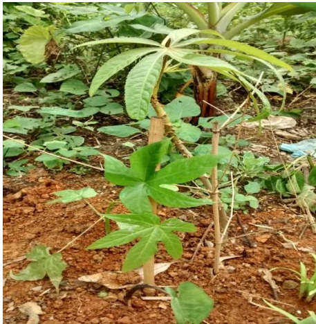
Fig. 1: Oreopanax xalapensis plant. The older young ones.

When we inquired about the different shapes of the leaves they told it to be because of age differences of the plant. The young leaves have lesser serration than the older ones (Fig. 1 and 2). Also it is found that they used to drink the decoction of the boiled leaf as Champhut (Vegetable soup). And when inquired about the occurrence of renal failure in their village they replied it to be seldom happened 5 . So it is the hard time for the researchers to investigate the usefulness of the plant parts in recovering renal failure for the welfare of the human species.