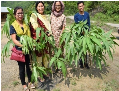
Fig. 3. Oreopanax xalapensis plant collected from Karong area during the survey programme.