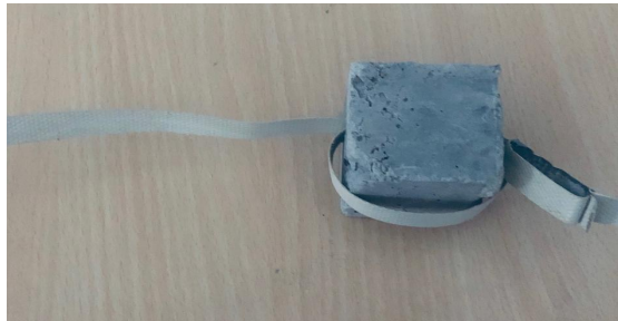
Figure3. Block at the end of the reinforcement

From the observation the maximum stress that the wall can withstand in end block anchored strip is 63.55\text{kN/m}^2 corresponding settlement is 650 mm at s/B\% is 4.33%