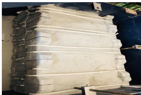
Figure2. Continuous strips so one face to another face

The maximum stress that the wall can withstand in continues strip so one face to another face is 177.45\text{kN/m}^2 corresponding settlement is 600 mm at s/B% is 4%