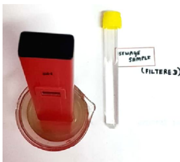
Figure No 5: "pH TEST"

The pH refers to the negative logarithmic of hydrogen ion concentration in the particular sample. The test was conducted by simply inserting the pH meter into the test samples and the value was noted for each sample. According to this test, Solutions with a pH less than 7 are acidic and solutions with a pH greater than 7 are basic. Pure water is neutral, at pH 7 (25 °C), being neither an acid nor a base. Contrary to popular belief, the pH value can be less than 0 or greater than 14 for very strong acids and bases respectively.