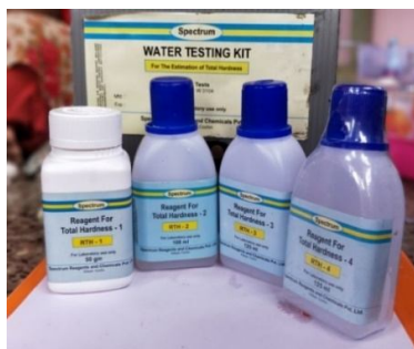
Figure No 7:“Hardness testing kit”

For hard water the inference is got by observing the color change as to from pink to blue and vice versa for soft water.