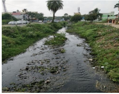
Figure No 1: “Improper Sewage into Water Body”