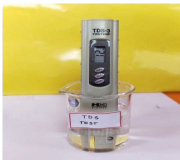
Figure No 6: “TDS test”