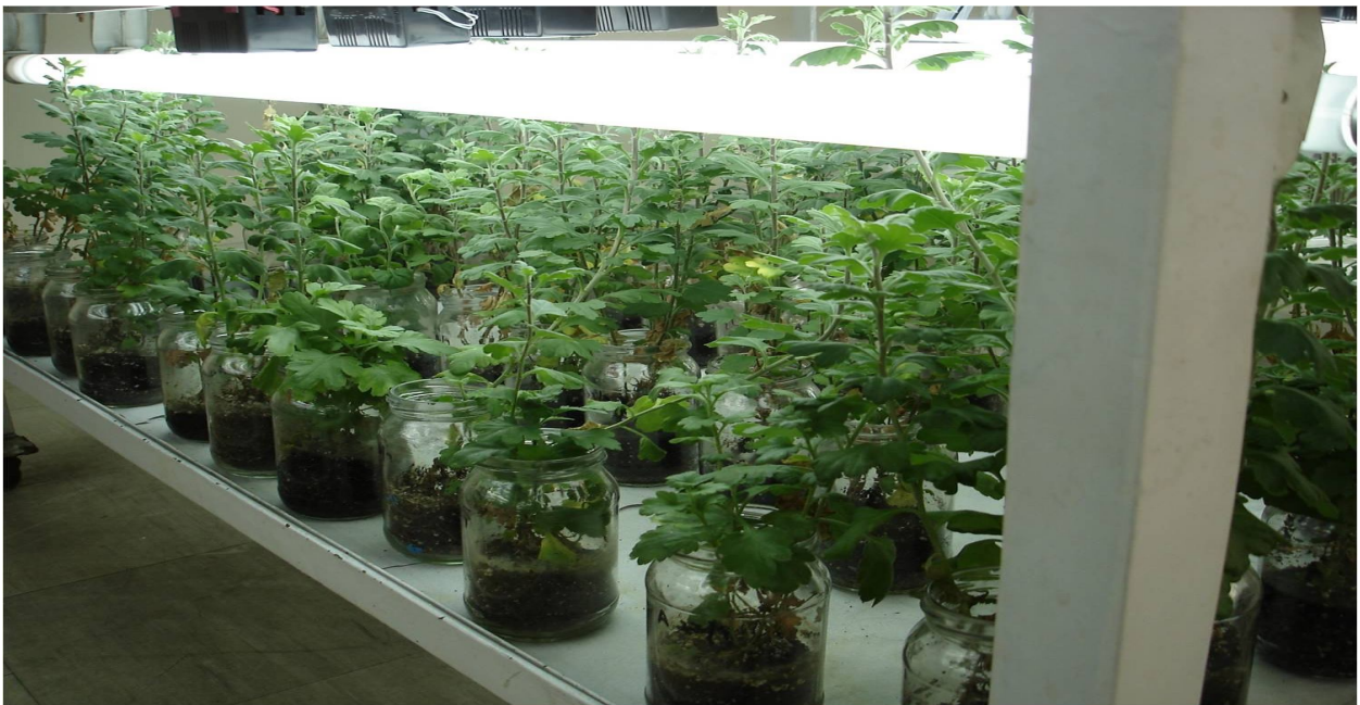
Fig.1: In vitro grown from auxiliary bud and further used as shoot explant for multiplication experiment.