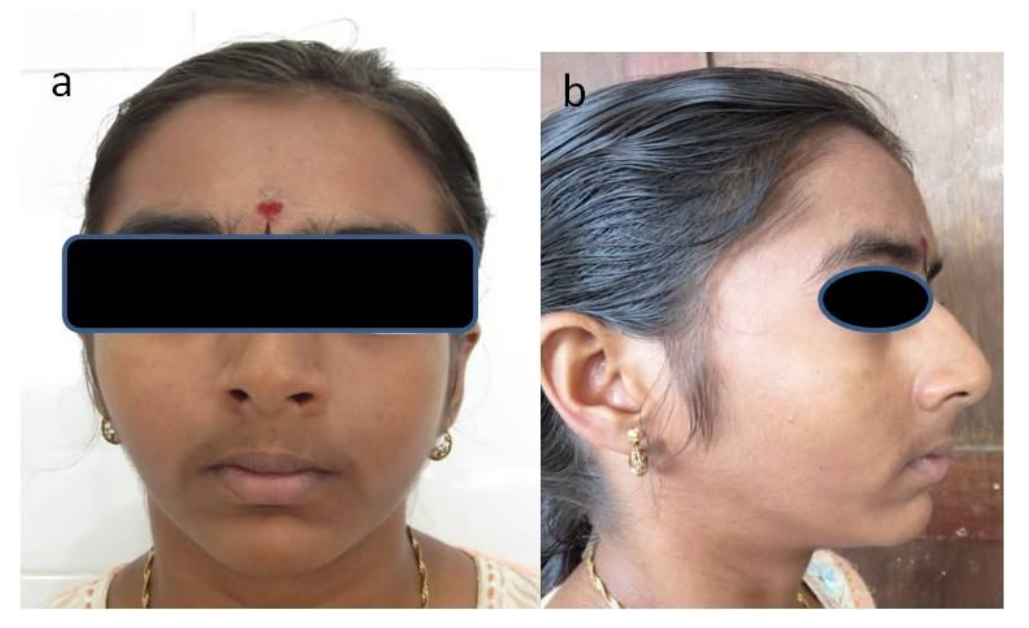
Figure 4: Extraoral frontal (a) and lateral (b) view of the second patient.

A 16-year-old female patient diagnosed with megalocornea of both eyes was referred from Government General Eye Hospital to rule out oral focal sepsis. Past medical and family history were not contributory except for megalocornea. Patient had attained her puberty at the age of 14 and has a regular menstrual cycle. On general examination no significant abnormality were noticed except for megalocornea of both eyes for which surgery had been planned. [Figure 4]