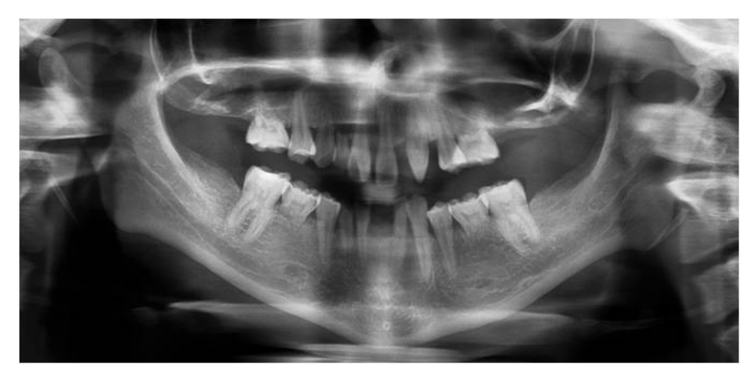
Figure 6: OPG showing congenital missing of 16 permanent teeth.

Orthopantomograph(OPG) showed no evidence of any developing permanent tooth bud or impacted teeth including second and third molar in both jaw with multiple retained deciduous teeth as examined clinically.[Figure 6]