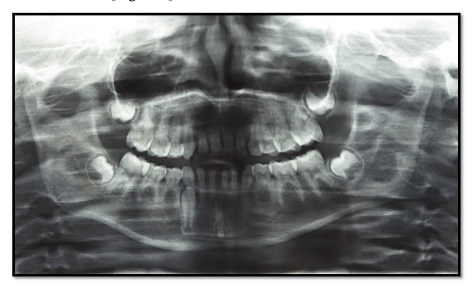
Figure 3: OPG showing complete absence of permanent successor except 43.

Orthopantomograph(OPG) of the patients revealed complete absence of all permanent successors except right lower canine with resorption of roots of deciduous upper and lower anterior teeth, developing tooth bud of permanent second molar.[Figure 3]