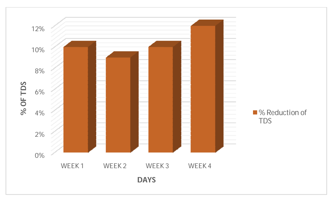
Figure2. Percentage Reduction of TDS