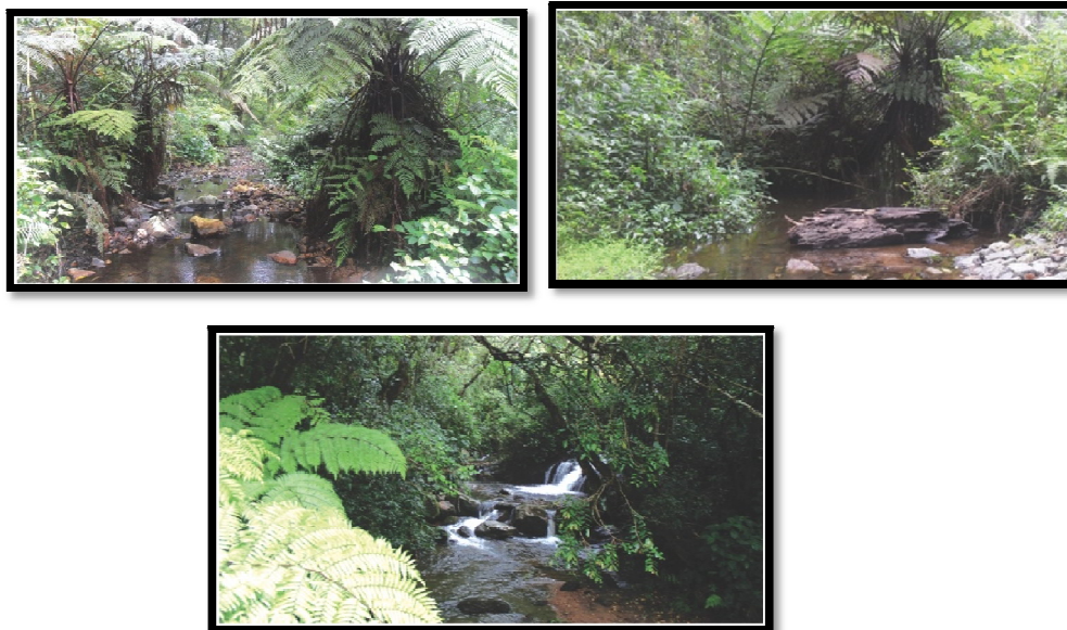
Figure 2 Collection Sites Showing Shola Forests – a).Mathikettan Shola National Park b). Pampadum Shola National Park c).Anamudi Shola National Park

Data Analysis: Species diversity indices such as Shannon-Weiner, Simpson's, Evenness, and Margalef were computed to understand the biotic community of each Shola.