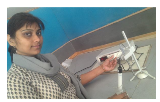
Fig3. Conductivity Test Total Solids

The electrical conductance is reciprocal to the electrical resistance and the G values show total ions per centimetre. It is a numerical expression of the ability of a water sample to carry an electric current. There was not much variation in the Site 1 samples between 1^{st} and 3^{rd} week but there was significance variation was noted in site 4 sample which was found to be 2846 \, \mu S in 1^{st} week and 3846 \, \mu S .