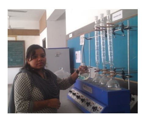
Fig5. Open flux method of COD

COD determines the amount of oxygen required for chemical oxidation of organic matter using a strong chemical oxidant, such as potassium dichromate under reflux conditions.