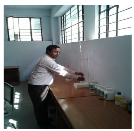
Fig4. Titration process for hardness