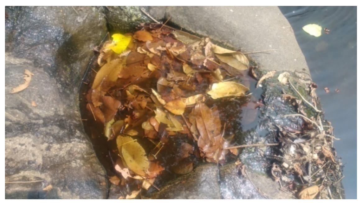
Figure 1: Leaf choked pothole

Specimens were observed and photographed using Leica stereozoom research microscope (Model: LEICA S8APO) with an attached digital microscope camera (LEICA MC170 HD). Identification was done following Vazirani, 1968. Systematic account on the species follows Deb R. (2017).