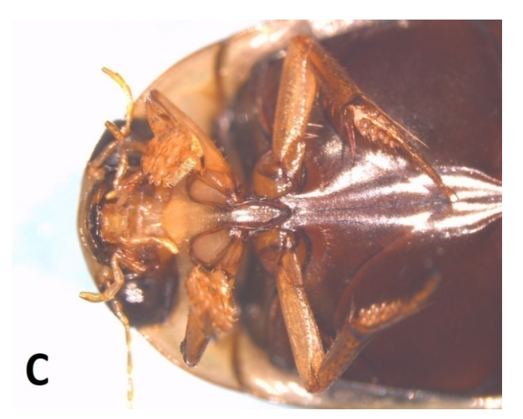
Figure 4: A. Hydaticus fabricii MacleayFemale(Dorsal view), B. Hydaticus fabricii Macleay Female (Ventral view), C. Hydaticus fabricii Male pro-tarsi enlarged and provided with Sucker palettes and meso-tarsi with sessile palettes.