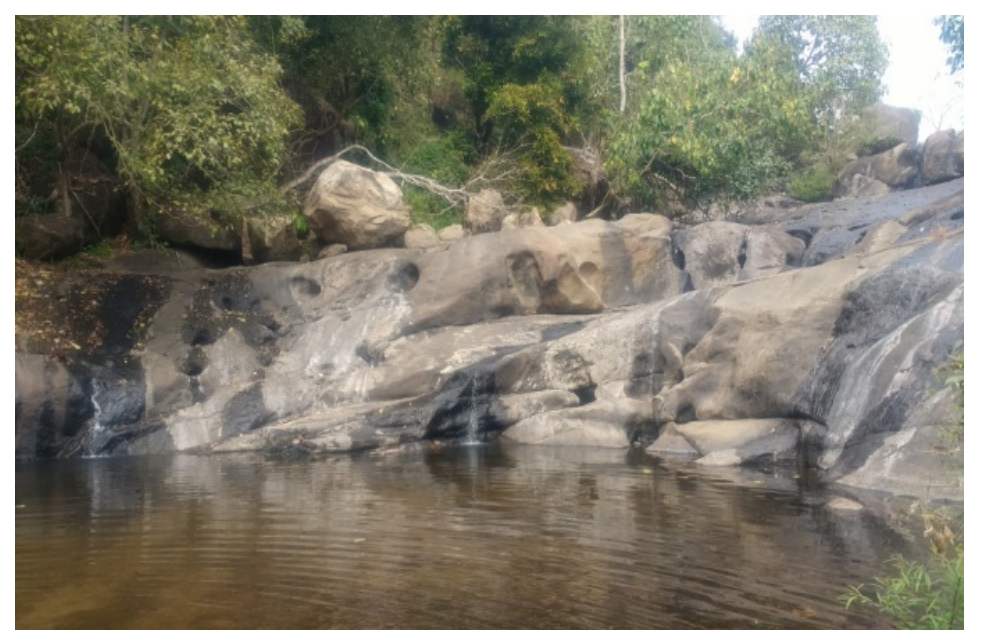
Figure 2: Exposed rock bed of olakkayam waterfall with potholes (View from the bottom)