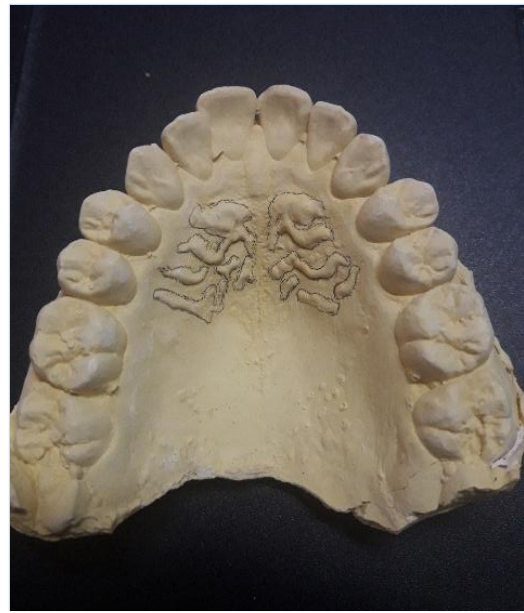
Figure- 3 African cast

The pattern of rugae was determined using Thomas and Kotze classification (Figure-4). 11 Parameters included in the study were: number, shape, and unification patterns of rugae. Also, lengths and widths of the rugae patterns were also measured.