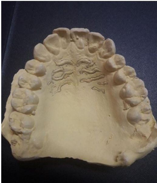
Figure- 2 Indian Cast