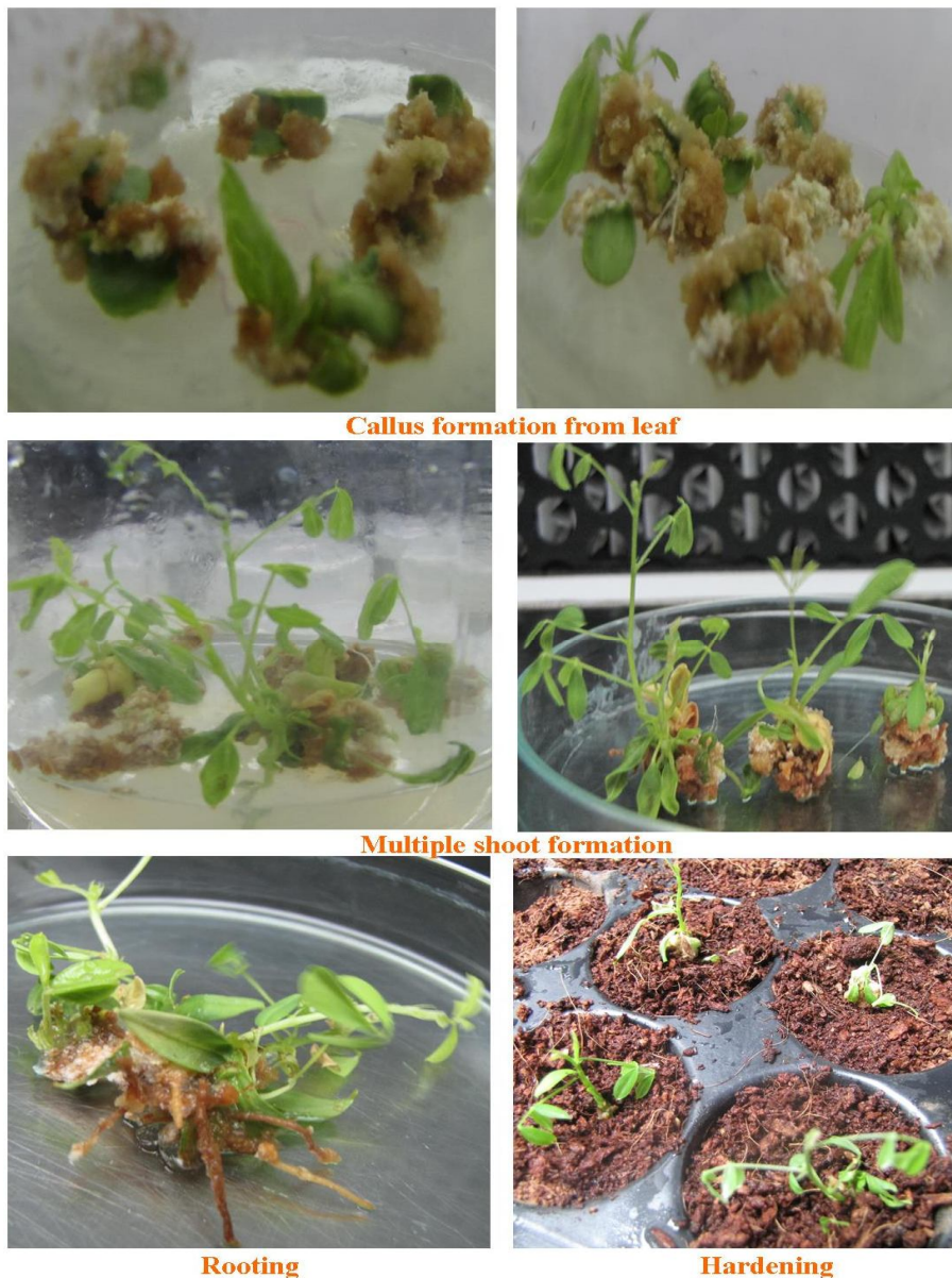
Figure 2 - Callus initiation, shoot, root formation and hardening of T. villosa .

# + Less callus, ++ Moderate callus, +++ Excellent callus