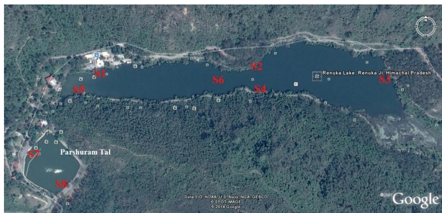
Figure 1. Ariel view of Renuka Lake and Parshuram Tal

Phytoplankton and Physicochemical analysis: Monthly sampling was carried out to collect data on phytoplankton community and selected physicochemical parameters and of the lakes during December 2013 to May 2014. Phytoplankton samples were collected by filtering 100 litre of water through phytoplankton net and preserved in 4% formalin. Further analysis was done in laboratory. Phytoplankton were identified up to the lowest recognizable taxonomic unit mostly genus following keys by 22, 23, 24 . Phytoplanktons were enumerated using Sedgwick-Rafter Cell Counter 25 . Physicochemical parameters were studied following standard methods 25, 26, 27 . Phytoplankton density was subjected to further analysis by applying the Shannon-Wiener species diversity index 28 Margalef (richness) index Evenness index and Palmer index.