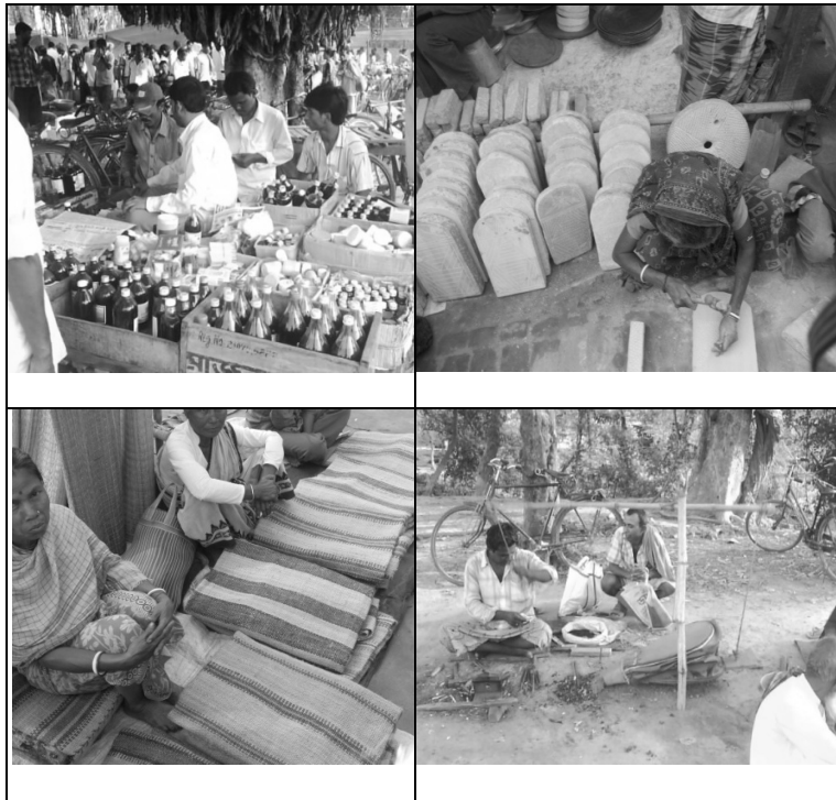
Plate : 1 Different types of Seller and Their Itinerancy