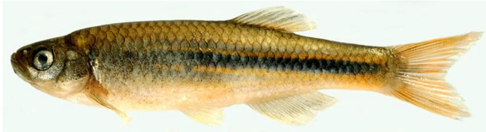
FIGURE 1. Devarioheirokensis , holotype MUMF 16016, 58.2 mm SL, Heirok River, a tributary of the Imphal River, Chindwin drainage, Thoubal District, Manipur, India.