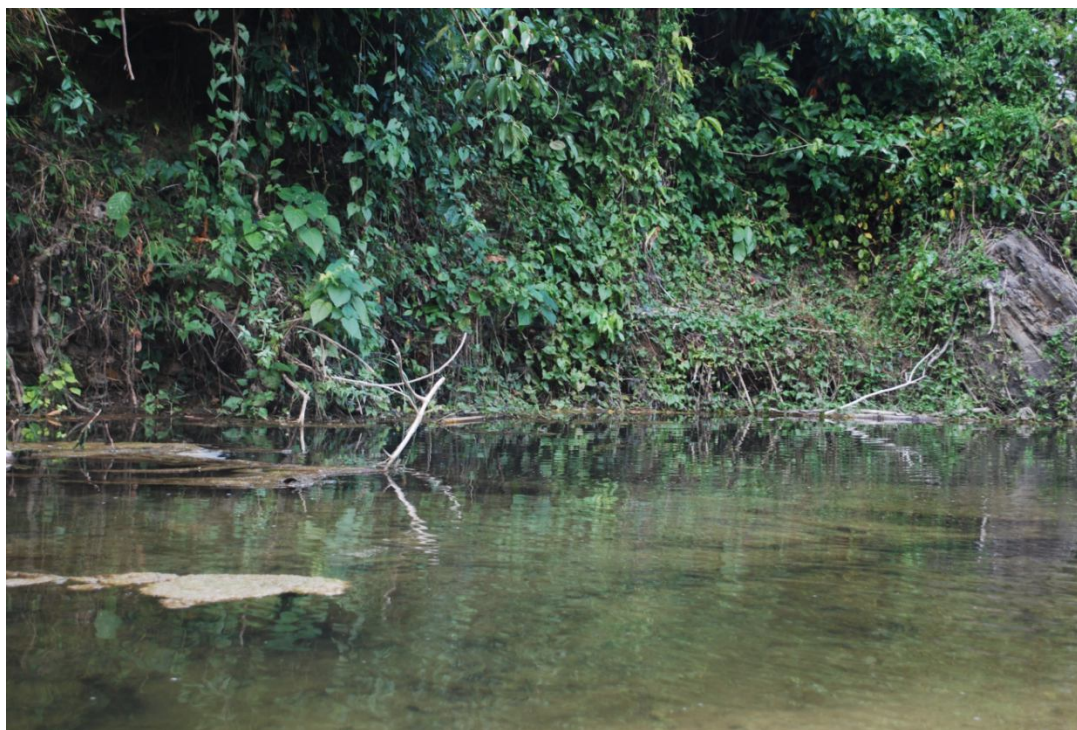
FIGURE 5. Heirok River, type locality and habitat of Devarioheirokensis .