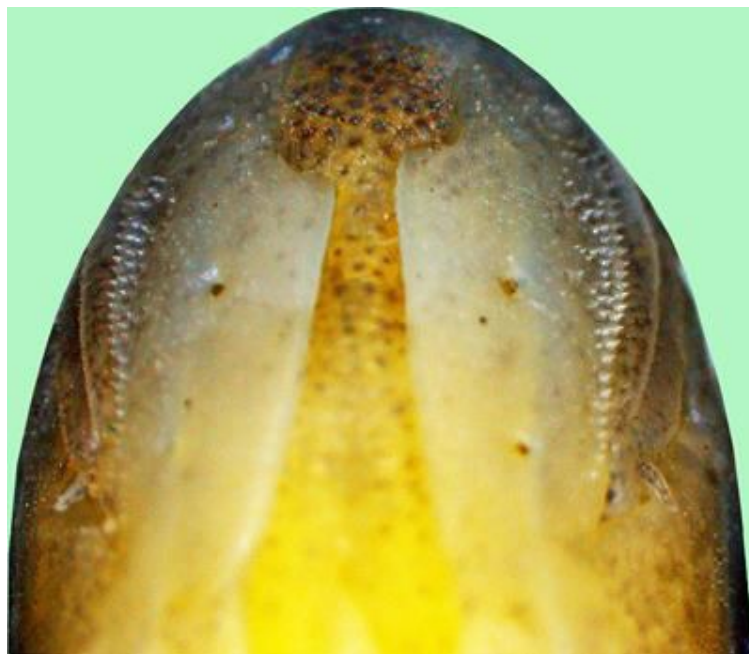
FIGURE 2. Ventral view of head of Devarioheirokensis , MUMF 16016, showing arrangement of tubercles.