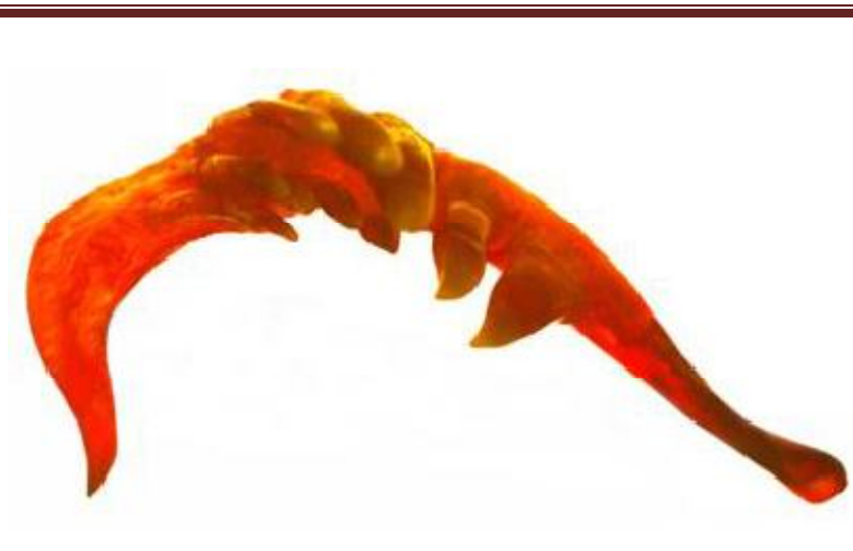
FIGURE 3. Devario heirokensis , MUMF 16022, 53.3mm SL, fifth ceratobranchial of left side in ventromedial view.