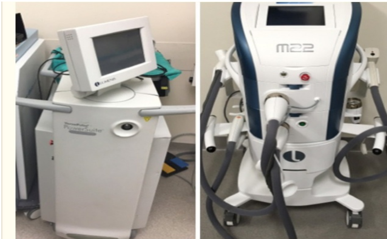
Figure (2a): demonstrates a Ho:YAG lithotripsy laser (A) and an neodymium;yttrium-aluminum-garnet (Nd:YAG) dermatologic laser (B).

The long-pulsed Holium: YAG laser on the other hand, uses a mostly photo thermal mechanism to fragment calculi. The laser produces light with a wavelength of 2,100 nm, which is extremely absorbable by water. Thus in the suitable environment, fluid absorbs the energy and is heated as a result. A cloud of vapor is produced, parting the water and allowing the lasting portion of the laser light to straight contact the calculus surface, drilling holes into it and leading to its fragmentation. A study which was conducted by Cimino et al. demonstrated that Ho: YAG laser lithotripsy is more efficacious endoscopic technique for the treatment of ureteral stones with higher stone fragmentation rates than compared to pneumatic lithotripsy, and a review conducted by Teichman concludes that this laser is harmless, real and works just as fine if not better than other modalities, and that, it may also be used for biliary stones. 10