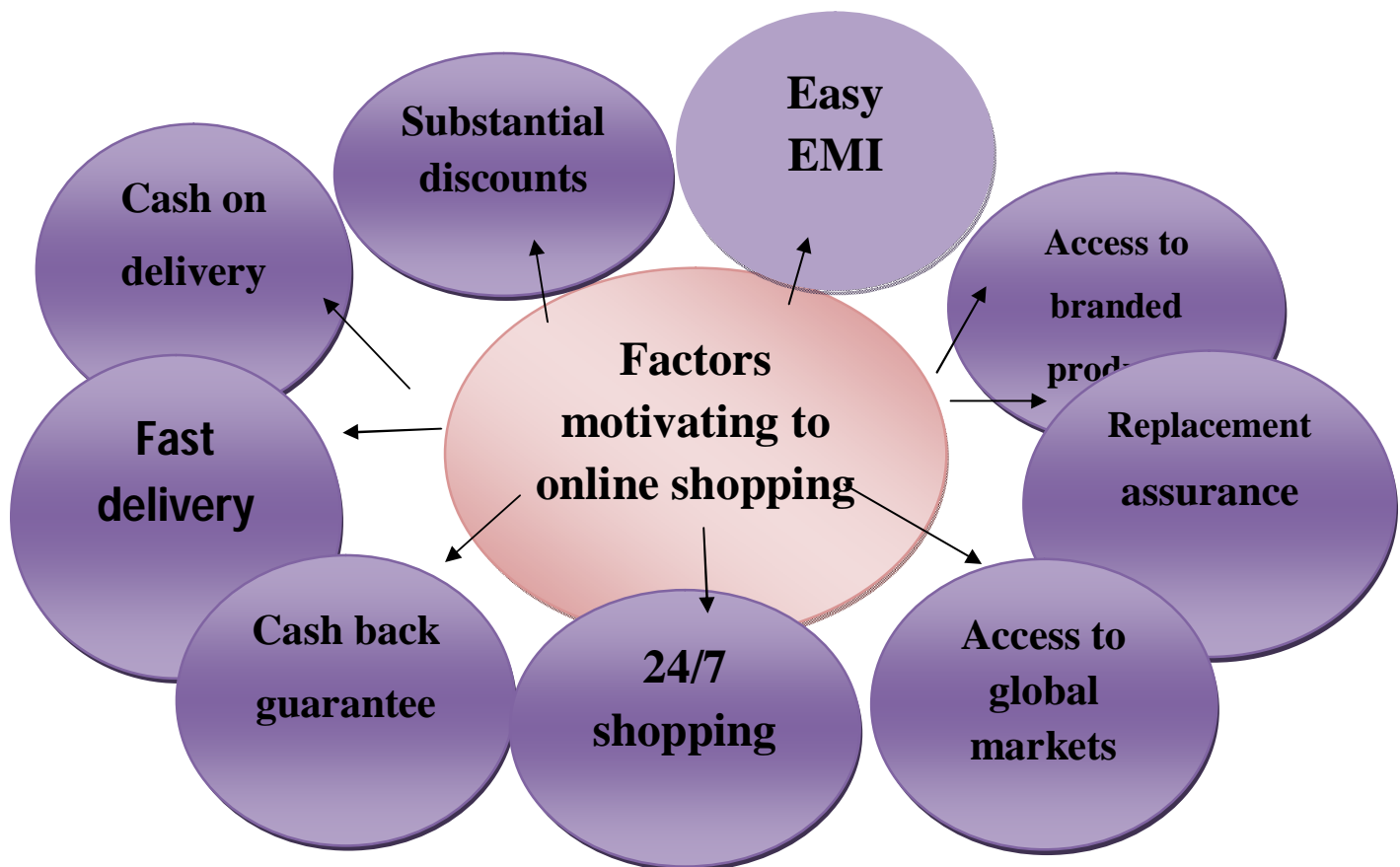
FIG 1: Factors Influencing Online Shopping