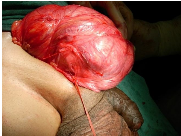
Fig 2. huge hernia on opening of inguinal canal.