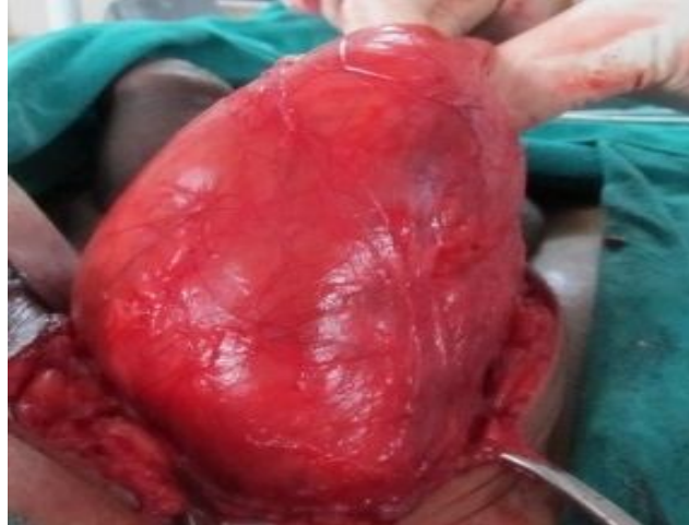
Fig 3. Hernial sac thinnest at the tip.