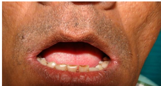
Fig 1 : Extra oral examination

The patient had completely edentulous maxillary and dentulous mandibular arch. Palpable fibrotic bands extending from right buccal frenum to vestibule resulting in shallow sulcus was noticed; also the mucosa appeared to be blanched on right side.