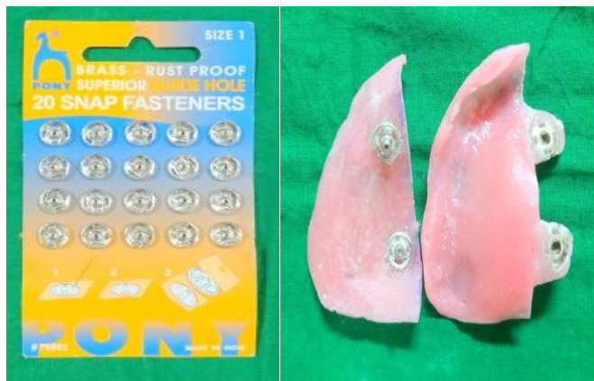
Fig 4a - snap fasteners

3. Sectional record base fabrication - Temporary record bases were fabricated on the master cast using autopolymerizing acrylic resin and were again sectioned through the midline. The sectioned halves were then connected using size '0' stainless steel press buttons (snap fasteners, Needle ind) fig 4a. These press buttons are commercially available, and have a male and female part, the male part were attached to one half of the record base ,then petroleum jelly was applied around the male part and then female part was attached over it. Then the two halves were joined using autopolymerizing resin fig 4b.