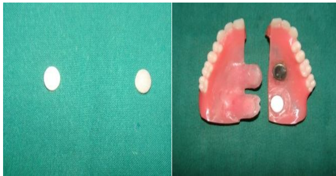
Fig 5a - Cobalt Samarium magnets Fig 5b - duplicated master

8 Prosthesis insertion - Fit and stability of the sectional prosthesis was checked (Fig 6). Instruction regarding the use and assembly of the sectioned denture was given to the patient, followed by post - insertion and oral hygiene instructions. Routine follow- up appointments were scheduled and observed for 6 months.