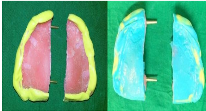
Fig 3 c - photoseal