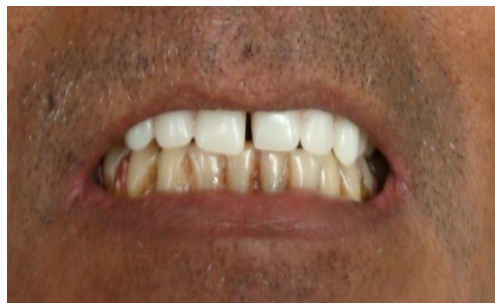
Fig 6 - sectional prosthesis