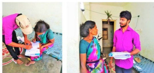
Figure 3: Interacting with Farmers