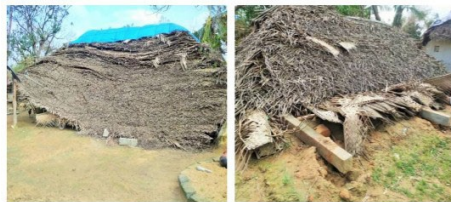
Figure 3: Affected areas