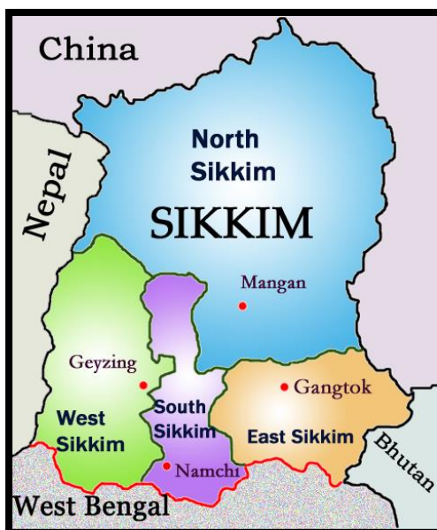
Fig-1 Location of Namchi In Sikkim

For this field study I have chosen Namchi, the capital of South Sikkim. Namchi is located at 22.17 degree north and 88.35 degree east. It has an average elevation of 1,315 metres (4,314 ft). Namchi is situated at an altitude of 1,675 m (5500 feet) above sea level. It is situated at a distance of 78 kilometres (48 mi) from the state capital Gangtok and 100 kilometres (62 mi) from the town of Siliguri. As of 2011 India census, Namchi has a population of 12194. Males constitute 52% of the population and females 48%. Namchi has an average literacy rate of 78%.