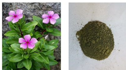
Figure1: Catharanthus roseus plant and plant powder

Accumulation of free radicals can cause pathological conditions such as ischemia, asthma, inflammation, neurodengeneration, Parkinson's diseases, mongolism, aging process and perhaps dementia (Sarabjot et al). The plant can grow easily and is commonly available in the sub-continent. Cantharanthus roseus has a variety of medicinal properties, such as antibacterial antifungal and antiviral (Carew et al). A variety of different alkaloids is present in Cantharanthus roseus more than 130 different compounds have been reported including about 100 monoterpenoid in dole alkaloids(Pereira et al). As an important medicinal plant, it has a good antioxidant potential throughout its parts under drought stress. Antioxidants are radical scavengers which give protection to human body against free radicals by inhibiting the oxidizing chain reactions. When these substances are present at low concentration in body they markedly delay or prevent the oxidation of an oxidizable substrate (Velioglu et al). These antioxidants always play important roles in delaying the development of chronic diseases, cancer, atherosclerosis, inflammatory bowel syndrome and Alzheimer's diseases.(Chun et.al)