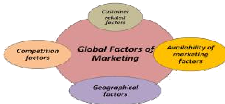
Fig 1 Marketing Factors Environment

In order to marketing presented the various factors at various phases in figure1 and 2.