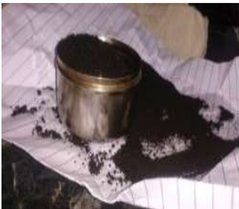
Fig.2 Carbonated potato peel powder