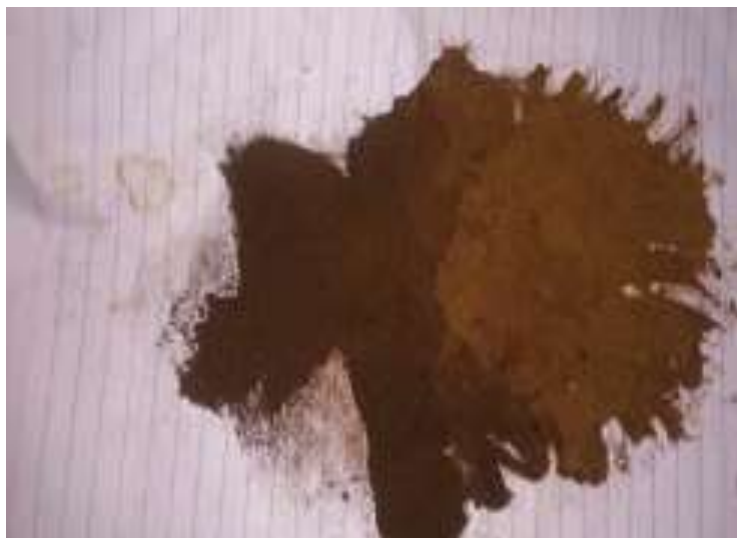
Fig.1 Potato peel powder after processing

This biomass was washed to remove any dust, foreign particles and extra undesired impurities attached to biomass. The washed biomass would be dried at 52°C for hrs. It was ground to powder in the domestic grinder. After adequate grinding the resultant powder is very fine. The bio-sorbent was sieved with 200 micron mesh. The particles retained in this sieve were again ground to fine particles to make its reuse.