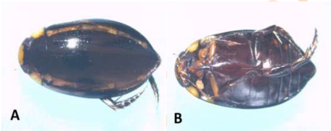
Figure 3: A. Hydaticusvittatus Fabricius (Dorsal view) B. Hydaticusvittatus Fabricius (Ventral view)