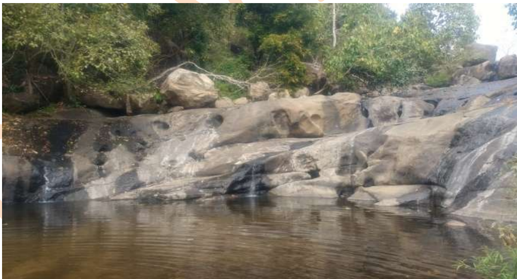
Figure 2: Exposed rock bed of olakkayam waterfall with potholes (View from the bottom)