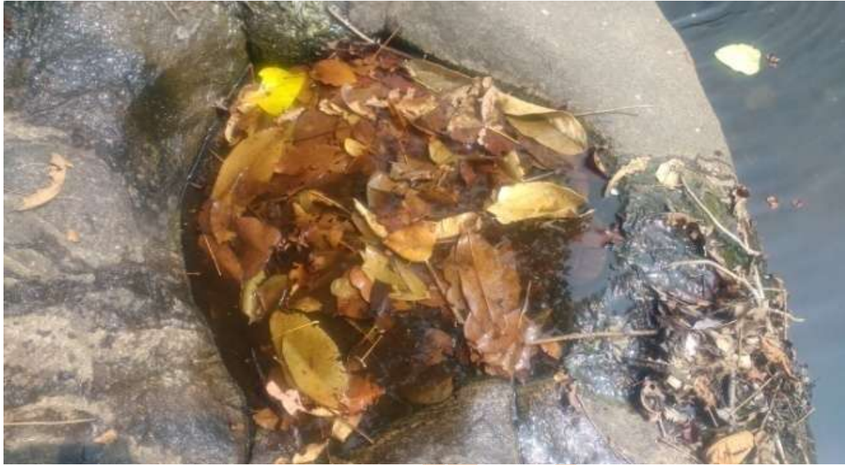
Figure 1: Leaf choked pothole

Specimens were observed and photographed using Leica stereozoom research microscope (Model: LEICA S8APO) with an attached digital microscope camera (LEICA MC170 HD). Identification was done following Vazirani, 1968. Systematic account on the species follows Deb R. (2017).