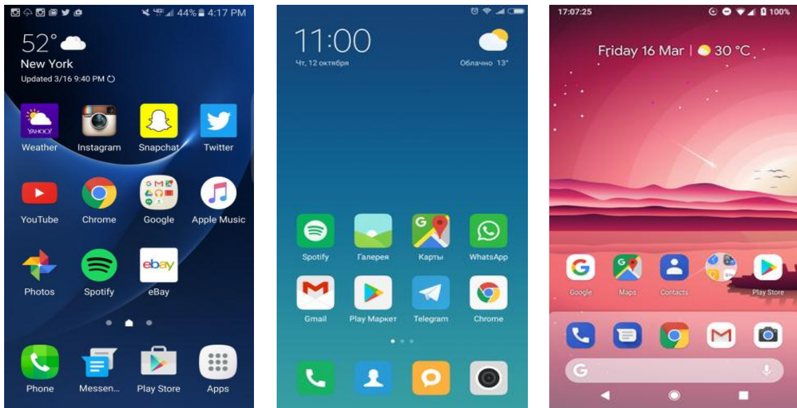
Fig.2 Screenshots of different skins (Samsung's Touch wiz and Xiao MI's MIUI) and Vanilla AOSP respectively