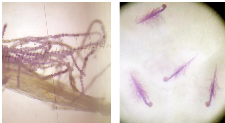
Figure 4. Pogostemon stellatus (Lour.) Kuntze, stamen bearded with moniliform hairs (Under Microscope).