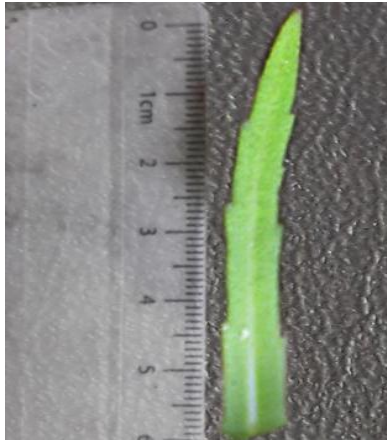
Figure 3. Pogostemon stellatus (Lour.) Kuntze, a sessile, linear, leaf, 5.9 cm long with acute apex.