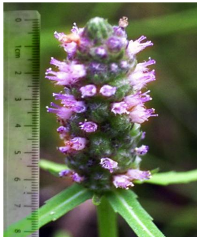
Figure 2. Inflorescence of Pogostemon stellatus (Lour.) Kuntze, a terminal spike of 5.5 cm long.