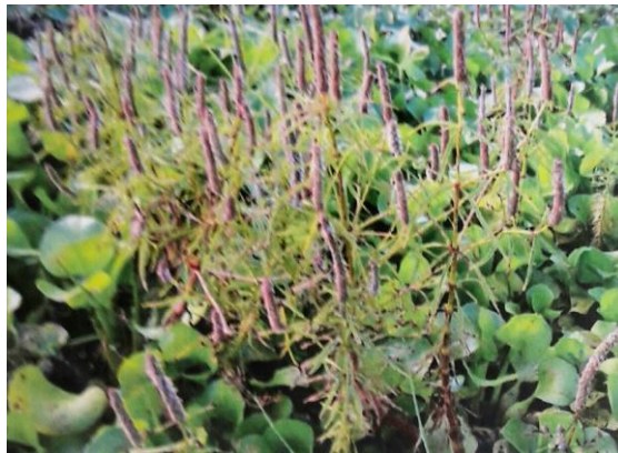
Figure 1. Habitat of Pogostemon stellatus (Lour.) Kuntze, herb of about 14-60 cm high, 12442 from Barpeta , District, Assam, India.

Global distribution: It is reported from tropical to warm regions of southern and southeast Asia (Moody 1989, Cook 1996), including India (e.g., Mumbai, Karnataka, Mysore, Chennai; Bhatti and Ingrouille 1997), Bangladesh, Lao PDR (Andersen et al. 2006, Newman et al. 2007).