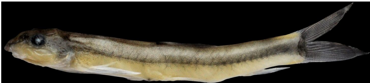
Figure 1. Lateral view of Schistura rubrimaculata , MUMF 18003, 30.4 mm SL, Taret River, Chindwin Basin, Tengenoupal District, Manipur, India.

Schistura rubrimaculata Bohlen & Šlechtová 2013 1