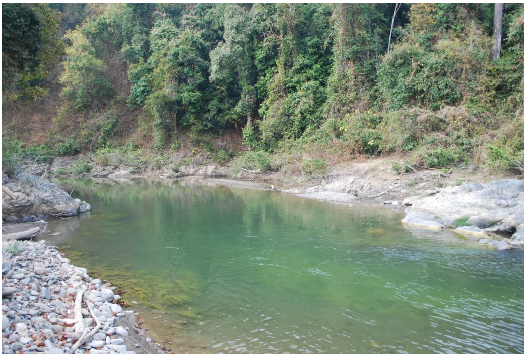
Figure 3. Taret River, collection site of Schistura rubrimaculata

Range as the natural occurrence range of the species. The occurrence of the species in the Taret River, a tributary of Yu River which drains into the Chindwin River, extends the natural occurrence range of S. rubrimaculata towards North into Manipur, India.