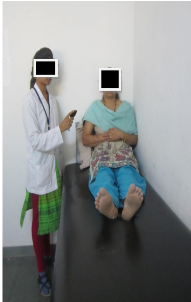
Figure 2: Slow Breathing Exercise