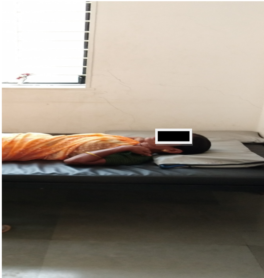
Figure 3: Jacobson's Progressive Muscular Relaxation Technique