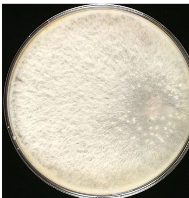
Figure 2: Irpex lacteus in culture