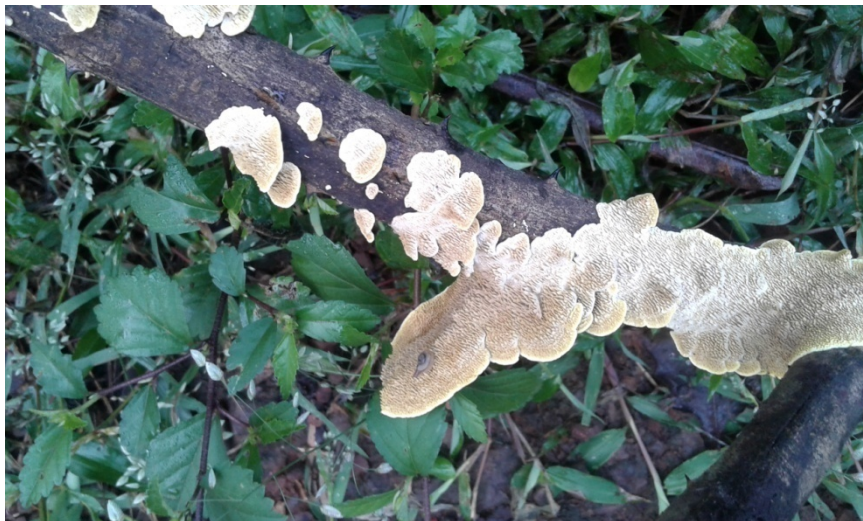
Figure 1: Irpex lacteus in natural habitat

temperature for 120 hours on orbital shaker. After 120 hours O. D. of reaction mixture was measured on UV-Visible spectrophotometer by taking 1mM AgNO 3 solution as a blank. The formation of silver nanoparticles was monitored visually by observing the change in colour of the reaction mixture (Figure 4).