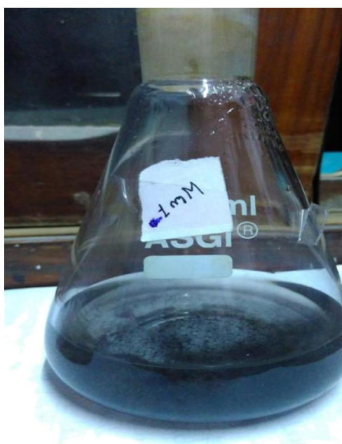
Figure 4: Synthesis of SNPs