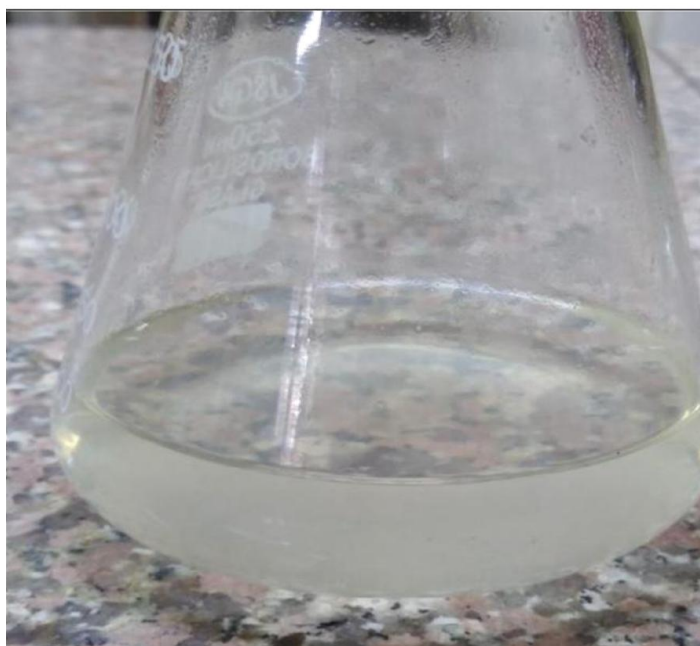
Figure 3: Cell free fungal extract