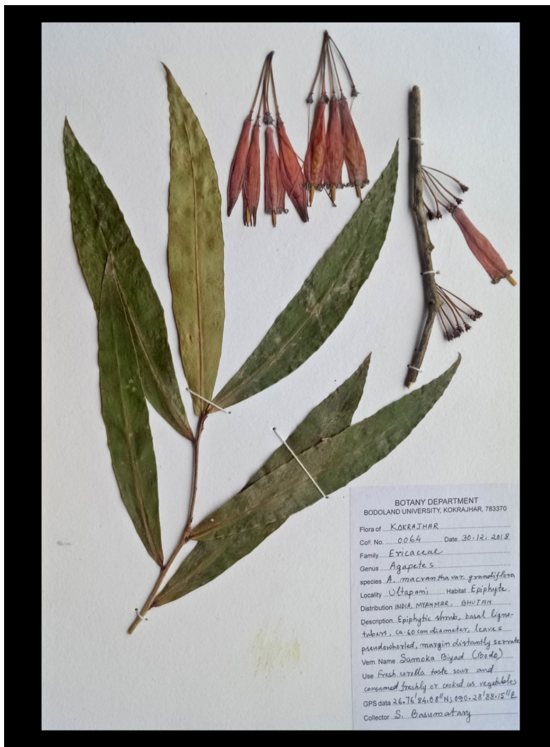
Figure 2: Herbarium specimen of Agapetes macrantha (Hook.) Hook. f. var. grandiflora B. Banik & M. Sanjappa