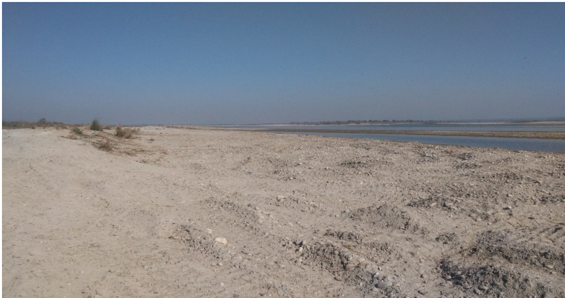
Figure1. The effect on riparian flora near the bank of River.

vegetation of the river and it shows the bank erosion 16 . The effect of riparian flora is due to the transportation of the River bed material from the river, floodplain mining and illegal mining near the bank of river. The riparian flora diversity is the interaction zone between the terrestrial and aquatic life. They provide food and other nutrients to aquatic animals, which is beneficial for the growth and development of the aquatic life. But due to the floodplain mining and illegal mining, the riparian floras of the rivers are destroyed like see in Figure 1 . The degradation of riparian zone is caused by the need to create the space for stockpiles and haul roads. These haul roads created by the vehicle wheels and they formed the bare tracks. In rainy season, when water flows these tracks in continuous flow they causing erosion. After erosion material increase the Sedimentation, Turbidity and deposition of pollutants in the river 22 .