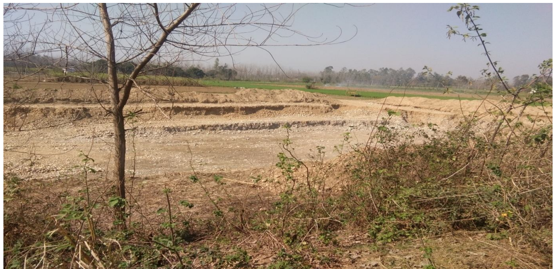
Figure 3. Illegal mining activity in the agricultural field.