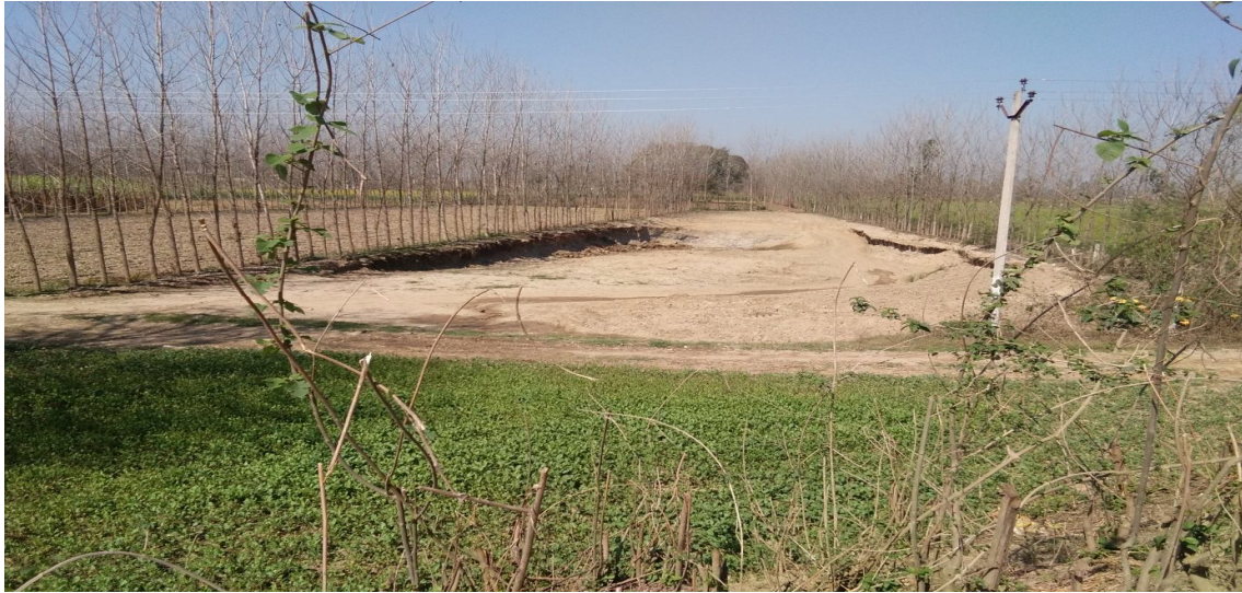
Figure 2. Illegal mining & erosion os sand near the active mining area.