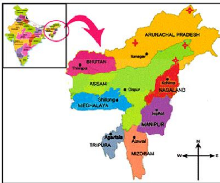
Figure 1: Location Map of study area.