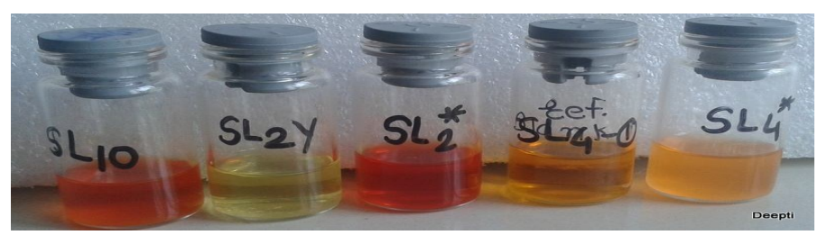
Figure No. 3. "Crude Carotenoid extracts in Methanol from screened carotenoid producing Haloalkalotolerent bacteria."

In present study all the isolates were found to produce carotenoids. Their degree of pigmentation was different. The isolates showing good degree of pigmentation were selected for evaluation of its antioxidant potential where the isolates SL_2^* , SL_4^* , SL_2y , SL_{10} and SL_{4-1} evaluated for antioxidant activity or free radical scavenging activity (%RSA). DPPH is the stable radical and is frequently used for of natural colorant product. Out of 05 different selected isolates SL_4^* and SL_2^* showed highest free radical scavenging activity i.e. 60% and 53% respectively. The isolate SL_2^* shown good degree of pigmentation as well as % RSA i.e. 2.8/g and 53% (Table-2) was selected for further studies. Similar studies on degree of pigmentation of carotenoid producing bacteria were carried out by Sasidharan et al <sup>10</sup> where highest degree of pigmentation was shown by bacterial isolate RS7 i.e. 8.31found.RSA were carried out by the Indra Arulselvi P. et al <sup>13</sup> by DPPH method showed 70% activity. NishinoT. et al <sup>14</sup> suggested that DPPH free radical scavenging activity of methanol extract depends on concentration of carotenoids and according to Snandesh K.<sup>15</sup> generally carotenoid potential for antioxidants vary many times in vivo due to pro-oxidant effect.