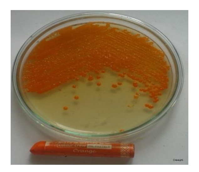
Figure No. 4. "Carotenoid producing Haloalkalotolerent bacteria SL2*"