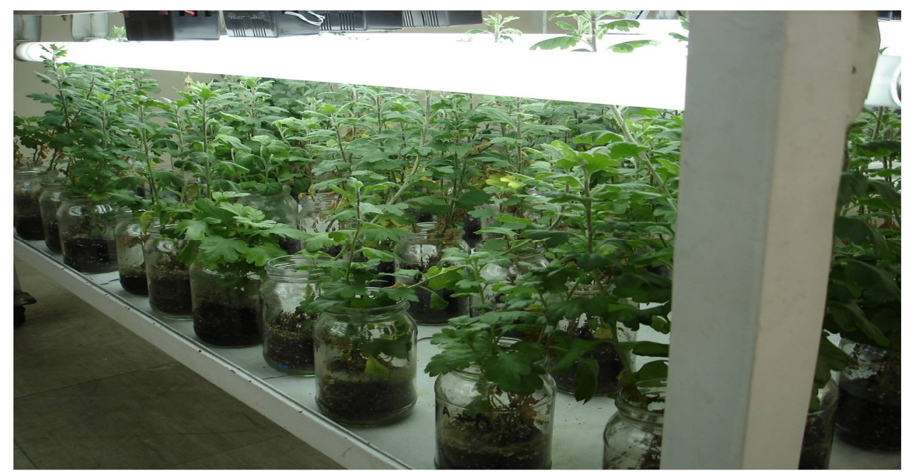
Fig.1: In vitro grown from auxiliary bud and further used as shoot explant for multiplication experiment.