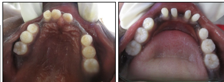
Fig.9&10 intraoral view maxilla and mandible

OPG revealed no evidence of any developing tooth bud or impacted teeth (Fig.11).