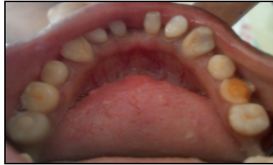
Fig.3 Intraoral view mandible

Intra- oral examination revealed missing – 12,22, (with retained deciduous 52,62- Fig 2,3) 17,27,37,47. All the remaining teeth were smaller than the average size in permanent dentition, occlusal tuberculated projection in 46( Fig .4), proclined upper anteriors with spacing, increased over jet and overbite, , class -1 molar relation on right and left side.(Fig .5) Almost all the teeth did not have lingual pit. The posterior teeth were also small and exhibited a short occluso-gingival dimension.