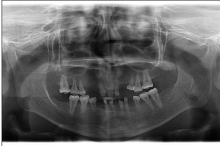
Fig.11 OPG shows conical tooth root

By considering above mentioned features, in both cases and absence of significant abnormalities on systemic examination, diagnosis of Non-syndromic occurrence of true generalised microdontia was given.