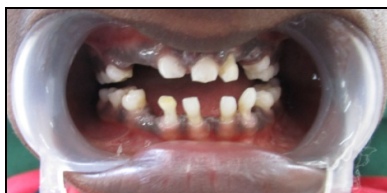
Fig.8 occlusion of the patient

History revealed no exfoliation of primary teeth. No significant abnormalities were noticed in skin, hair, nails, eyes and ears (Fig.7) however intra-oral examination revealed open bite in the anterior region and improper contacts between the upper and lower molars. All deciduous teeth appear retained except missing counter parts of 12, 13 and all permanent first molars are erupted. (Fig.8, 9, 10)