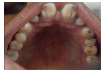
Fig.2 Intraoral view maxilla