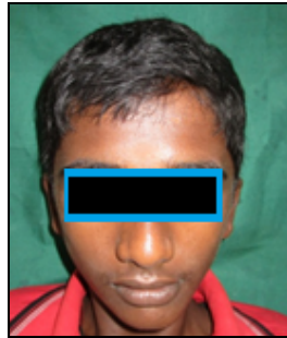
Fig.7 extra oral view of the patient

A 15 year old boy reported to the Department of Oral Medicine and Radiology with chief complaint of small teeth. Family history revealed that he was born out of consanguineous marriage. None of the family members had similar features.