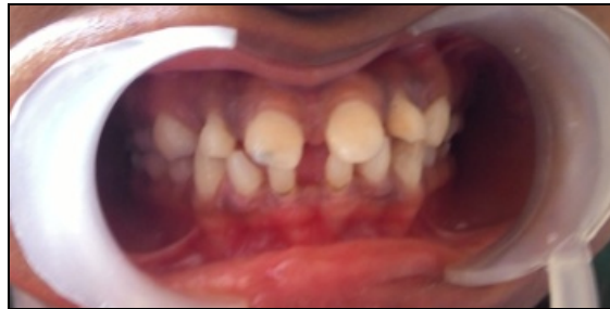
Fig.5 occlusion of the patient

OPG revealed mesio-distal diameter of all the teeth was smaller than the normal adult tooth size, retained deciduous 52,62 and no evidence of permanent tooth bud in 12,22,17,27,37,47.(Fig.6)