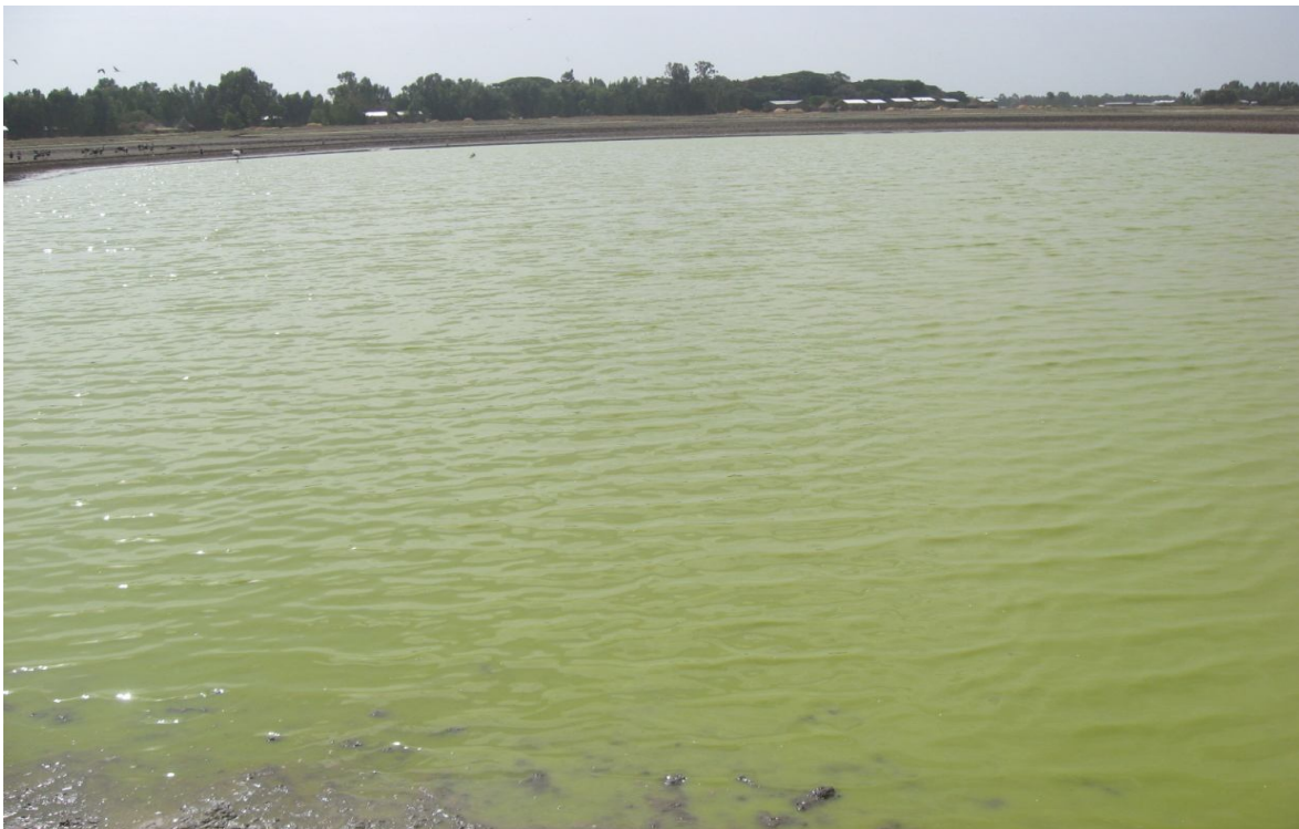
Figure 3: Cyanobacteria blooming at Wolela wetland 5.5 km far from Lake Tana shore, has hydrorological connection with Lake Tana

flock Labeobarbus fish spp. and others breed, reproduce and provide nursery sites for the small ones. Additionally, the refusal incidence/low acceptance of tilapia fish by consumers and restaurants due to cyanobacteria contamination has been dramatically increased. Hence, the fishers have been compelled to shift catching other fish species such as Labeobarbus and catfishes. Clearly, the combination of these effects causes an intensive pressure on the population of the endemic Barbus fish species of Lake Tana which aggravate the already declined and exploited resources 34 . The problem shall not be awaited there; it will spread over other corners of the lake and probably cover the whole lake within a few years time as long as participatory management and planning practices is not soon implemented. If the eutrophication continue to happen, non selective, the massive fish kill will follow. The support of more than 30 thousand fishers and their family that depend on these resources will say goodbye to their livelihood if this situation persists, and the fishery industry would eventually be gone. The ecosystem of the lake is also disrupted and other consequence that we cannot expect will happen.