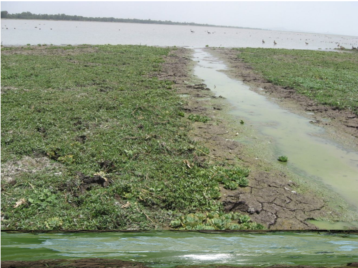
Figure 2: Cyanobacteria blooming and scum at the eastern part of the Lake Tana shore where the problem has been occurring, Rib river mouth

The phytoplankton and zooplankton community composition and relative abundance of the study area were presented in Table 2. The samples were known to contain more than 15 taxonomic groups. The phytoplankton was represented by blue-green algae, green algae and diatoms while zooplankton by Copepods, Daphnia and Rotifers.