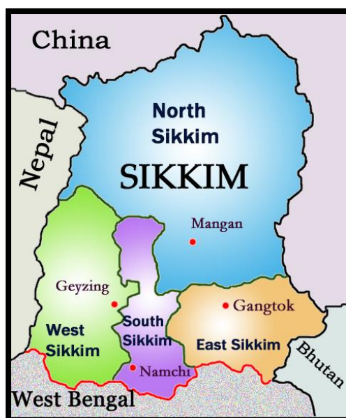
Fig-1 Location of Namchi In Sikkim

For this field study I have chosen Namchi, the capital of South Sikkim. Namchi is located at 22.17 degree north and 88.35 degree east. It has an average elevation of 1,315 metres (4,314 ft). Namchi is situated at an altitude of 1,675 m (5500 feet) above sea level. It is situated at a distance of 78 kilometres (48 mi) from the state capital Gangtok and 100 kilometres (62 mi) from the town of Siliguri. As of 2011 India census, Namchi has a population of 12194. Males constitute 52% of the population and females 48%. Namchi has an average literacy rate of 78%.