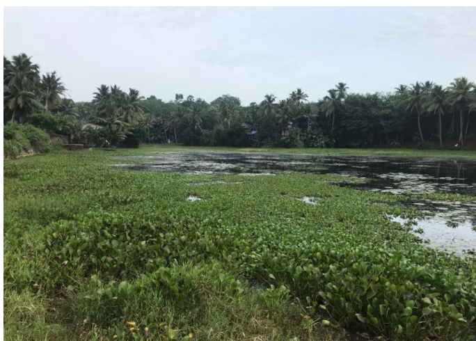
Fig.1 - Study Area Valvaithankoshtam Pond, Kattathurai

Water samples were collected in sterile bottles with holding capacity of about 2 litres, which was then used for analysis. During the analysis, the physical, chemical and bacteriological composition studies were made.