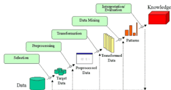
Figure1: Knowledge Data Mining

Data mining refers extracting knowledge and mining from large amount of data. Sometimes data mining treated as knowledge discovery in database (KDD). KDD is an iterative process, consist a following step shown in Figure1