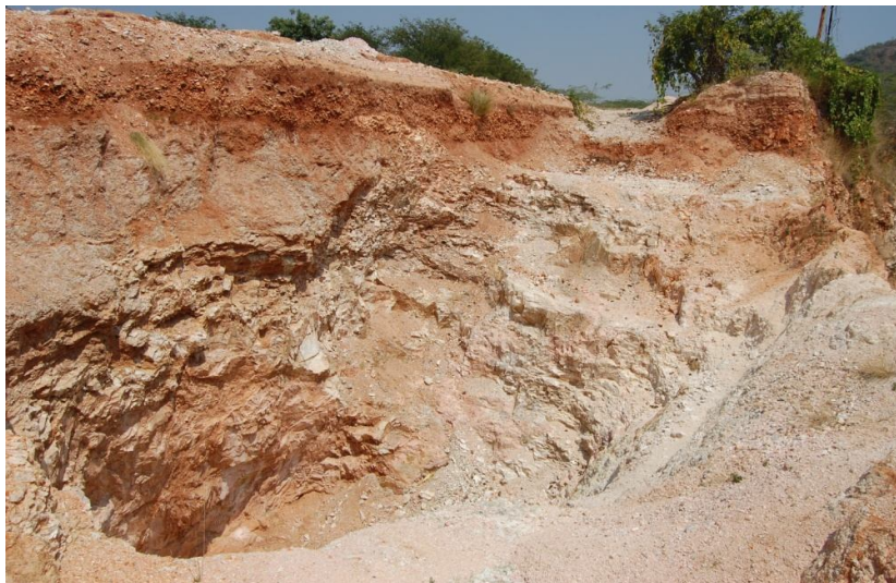
Figure.4: Photograph of Pegmatite mining area.