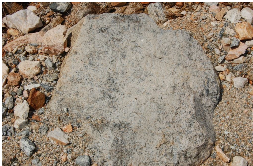
Figure.2: Photograph showing boulders of Pegmatite rocks in Valayapatti.