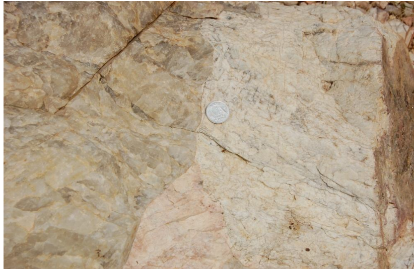
Figure.3: Photograph showing contact between Quartzite and Pegmatite.