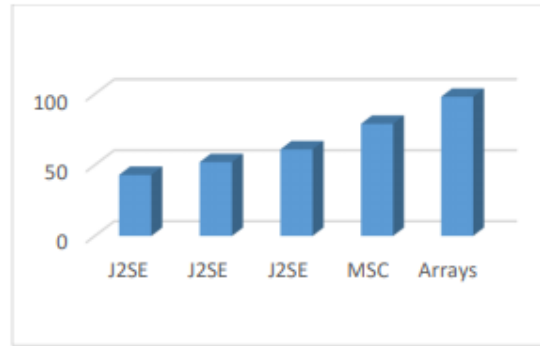
Figure 2. Bar Chart