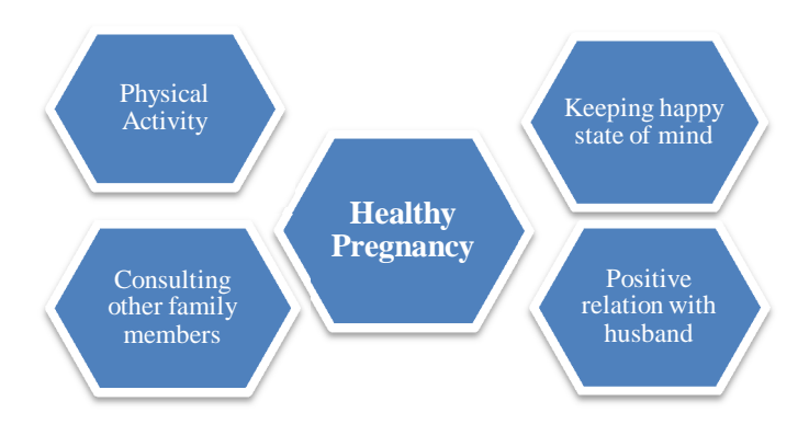
Figure 1. Healthy Pregnancy and sub-themes