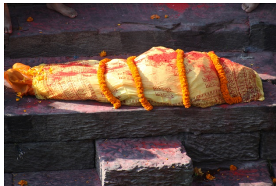
Figure 4. Hindu corpse wrapped in holy cloth & garlands by the bank of river Bagamati. 7

Preparations for the funeral begin immediately. The body is washed by family members & close friends. For the ritual washing, the deceased's head should be facing southward. A lighted oil lamp & a picture of the deceased's favourite deity should be kept by the deceased's head. For the "Abhisegam" (holy bath), the body is washed in a mixture of milk, yogurt, ghee (clarified butter), honey & purified water. While the body is being washed, those washing should recite mantras. Once the body is cleaned, the big toes should be tied together, the hands should be placed palm-to-palm in a position of prayer, and the body should be shrouded in a plain white sheet. If the person who died was a married woman who died before her husband, she should be dressed in red.