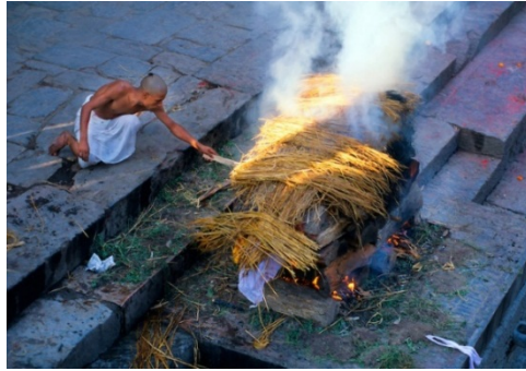
Figure 5. Cremation of dead body by the son along the bank of river Bagamati. 8

The day after the cremation, the Karta will return to the crematory and collect the ashes. Traditionally, the ashes should be immersed in the Ganges River. The cremation of the deceased marks the beginning of the mourning period, which lasts for 13 days.