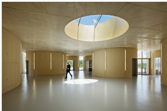
Figure 15. Use of natural light inside Amiens crematorium. 23

The phenomenon of death itself is a neglected and horrifying image for the common. Another reason behind improper crematoriums is the architecture of it. Being important part, but still unplanned sector have a need of interference of architecture & design in crematorium. The architecture of places like such should be calm and appealing. Each and every form, pillar, stone as well as turn towards the cremation space should indirectly help in healing bereavement. The entrance to the crematorium can be made in such a manner that to console the loved ones. When the state of the mind is in deep sorrow, the openness of the design helps in consoling the person. Proper natural shading from the south-side direction and use of metals for symbolizing pure and ethic look will help. Proper planning of the places according to the rituals will help in proper circulation throughout the site. Lightning should be proper and able to give an impression of the calm and quite atmosphere.