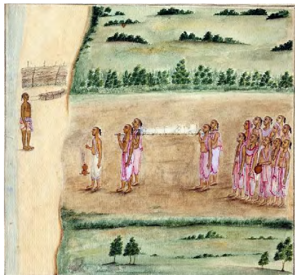
Figure 1: An 1820 Historic painting showing a Hindu funeral process from South India. 2

Cremation in India is first attested in the Cemetery H culture from 1900 B.C.E, considered formative stage of Vedic civilization. The Rigveda contains a reference to the emerging practice, in RV 10.15.14, where the forefathers both cremated ( agnidagdhá ) and uncremated ( ánagnidagdha ) are invoked.