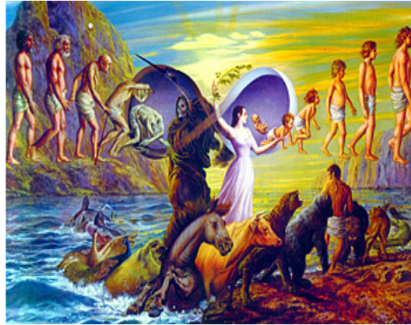
Figure 3. Hindu life cycle/Samsara showing Reincarnation and Rebirth. 6