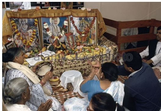
Figure 7. Rite of Preta-karma by the Hindu Priests. 10

A photograph of the deceased will displayed, and a garland of flowers will be placed on the photograph. Throughout the mourning period, the rite of “ preta-karma ” will be performed, which assists the disembodied spirit of the deceased to obtain a new body for reincarnation. One year after the death, the family will observe a memorial event called “ sraddha ,” which pays homage to the deceased. The Karta will invite Brahmins, members of the highest caste, to the home and provide them with an elaborate meal.