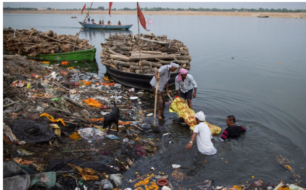
Figure 10. Body is dipped in holy water before cremation. 16