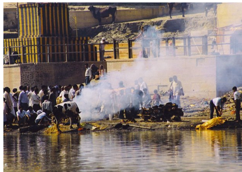
Figure 8. Image showing the air pollution caused due to burning of dead bodies along the bank of river Ganges 13

Carbon monoxide results from the incomplete combustion of the container, human remains, fuel, and other contents. Sulphur dioxide is produced from the combustion of fossil fuels, container, and contents. Nitrogen oxides are formed by high temperature combustion processes through the reaction of the nitrogen in air with oxygen. Mercury emissions originate from the dental fillings that may contain 5 to 10 grams of Mercury depending on the numbers and types used. Hydrogen fluoride and hydrogen chloride results from the combustion of plastics contained in the container and from stomach contents. NMVOCs are produced from incomplete or inefficient combustion of hydrocarbons contained in the fuels, body, and casket. Dioxins and furans result from the combustion of wood cellulose, chlorinated plastics, and the correct temperature range. 1112