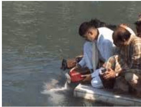
Figure 6. Antim Sanskara (Asthi Visarjan) in the holy water of river Ganges. 9

The day after the cremation, the Karta will return to the crematory and collect the ashes. Traditionally, the ashes should be immersed in the Ganges River. The cremation of the deceased marks the beginning of the mourning period, which lasts for 13 days.