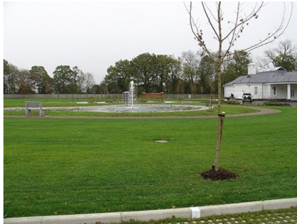
Figure 14. Relation between water body and green space. 22

Physical environments include lawn areas, forest and lakes, relations between places created by such things as barriers, paths, vegetation views and qualities etc. these engaging natural surrounds are a place of comfort for the people suffering from the death of a loved one. The mix of natural and built environment helps the bereaved heal from death and grieving.