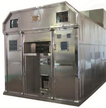
Figure 12. View of Electric crematory machine cremator over furnace. 19