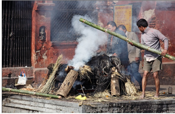
Figure 9. Open-air cremation being carried out at ghat besides Pashupatinath temple. 15