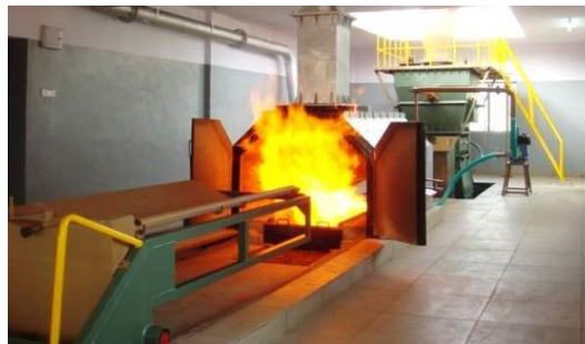
Figure 13. Cremation process going in wood based cremation. 21

Gasifier converts solid biomass into more convenient to use combustible gaseous form called producer gas through series of thermos-chemical reactions under reducing environment at high temperature. Gasifier based cremation system was developed to make an energy-efficient, eco-friendly, user-friendly method of cremation & the special attention was seen towards enhancing its social acceptability. Substantial decrease in the fuel wood consumption was seen. The cremation done in the wood gasifier based cremation does not produce smoke and helps in reducing the dependence on forest for wood pyre. 20