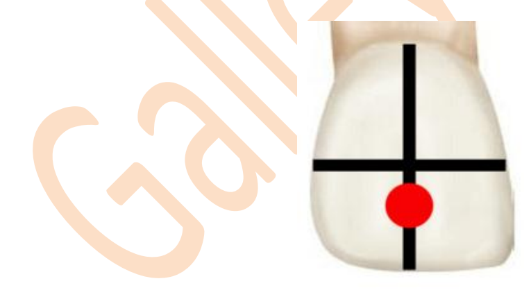
Figure 1 :Labial Access Cavity Design

a shallow reference depression was cut with a small round diamond bur just occlusal to the midlabial point of the tooth (Figure 1). The correct position of the initial depression related to the size of the pulp chamber was determined by the radiograph The teeth were accessed at the mid labial surface and extended only as necessary to detect canal orifices, preserving pericervicaldentin and part of the chamber roof.